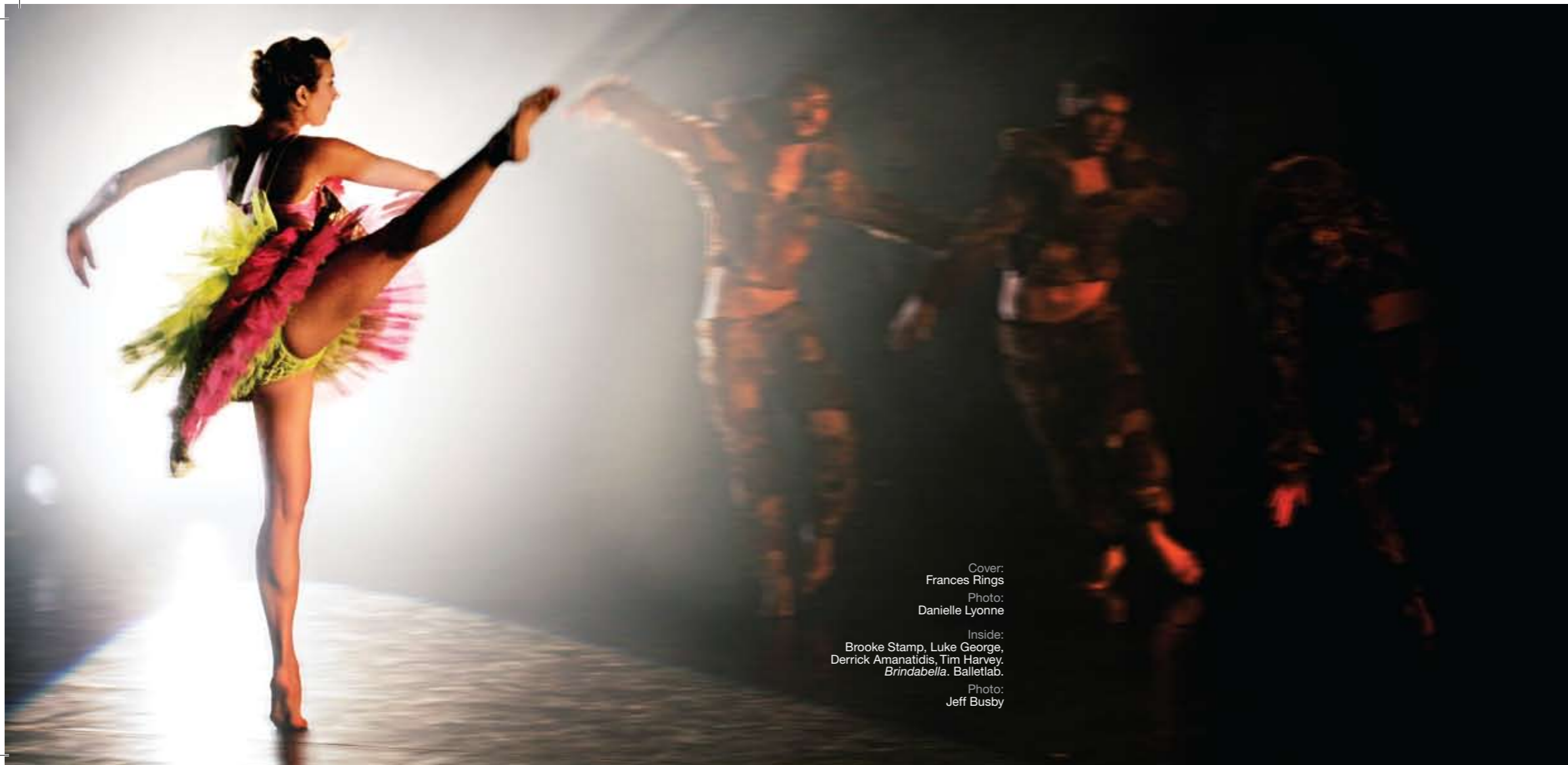
Cover: Frances Rings