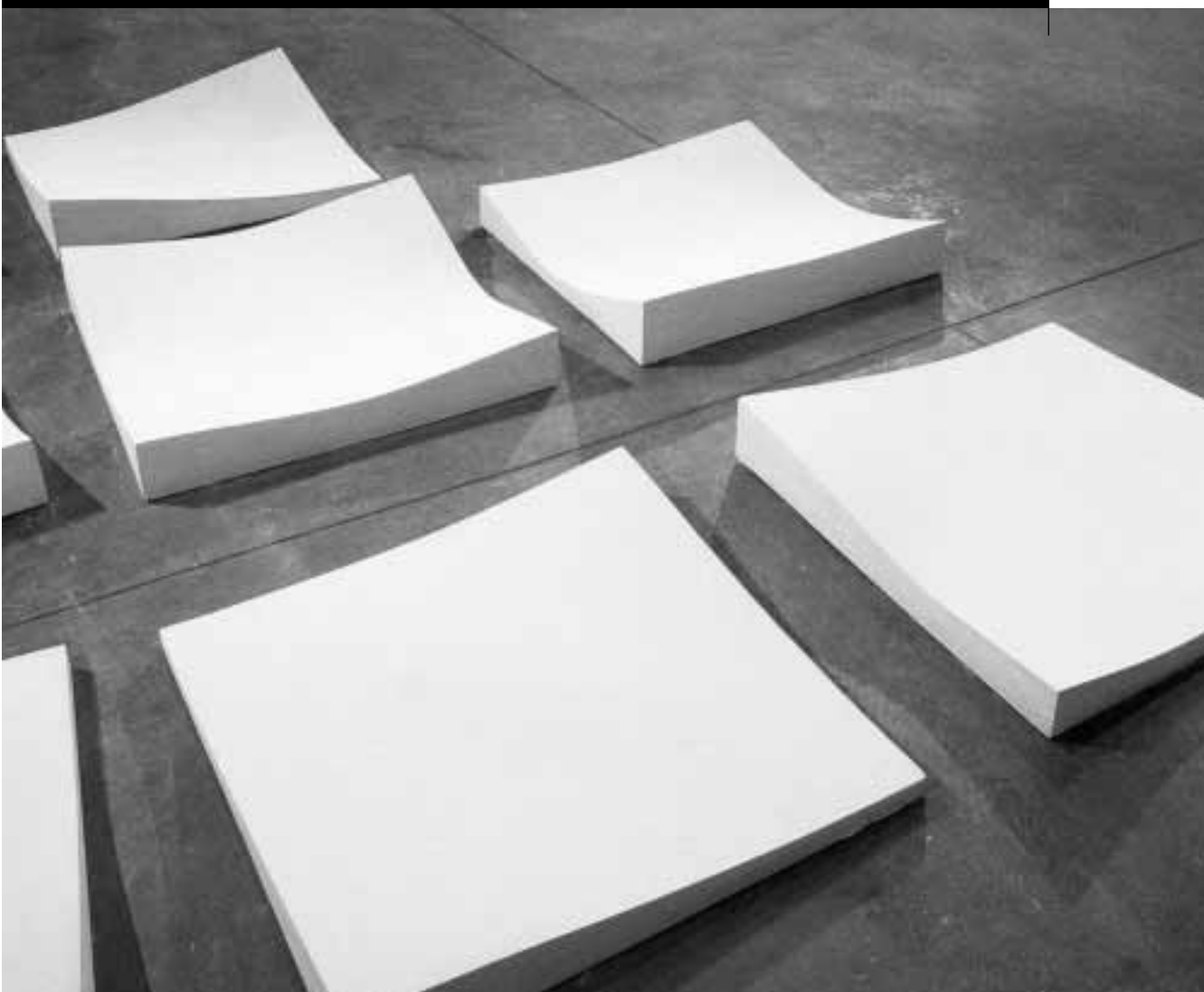
IMAGE: White Under Current , (detail), 1999, each 80 x 80 x 20cm. ARTIST: Susan Milne. Funded by Visual Arts/Craft Board.